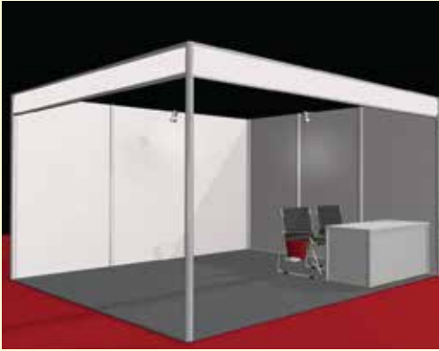
Standard booth (3mX3m)